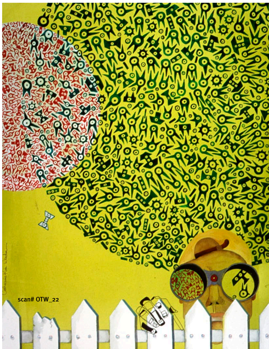
Grass is Greener (_____ on _____, 22½x28)

“As I was developing my style, my work tended to be either figures like the hands in this piece or more colorful and illustrative. I wanted to create a way to include all my styles into one way of working. The critters (the shapes that fill the circles) are the most recent addition to my style palette and give me freedom to paint any subject while giving my paintings a signature element. (I use blue painter’s tape as my resist; I cut out the shapes with an X-Acto knife for some of my critters.)